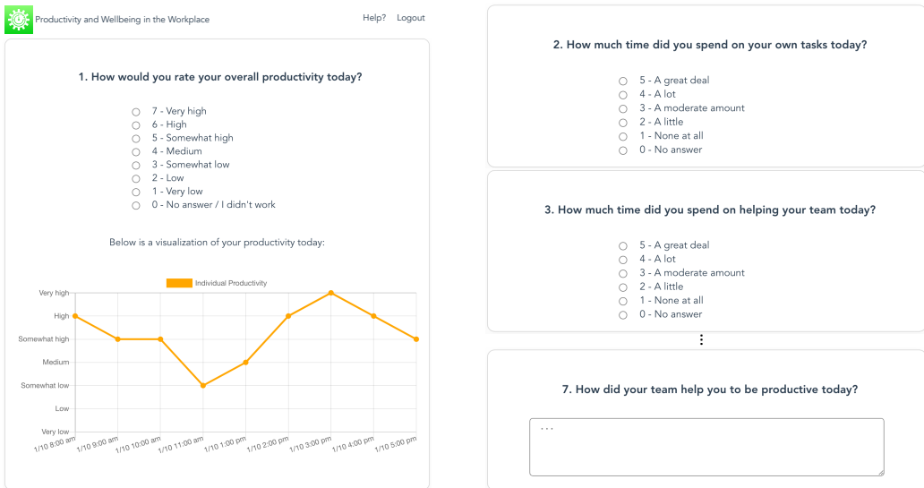
Fig. 3. Screenshots of the web application and sample questions, including the team nudge question (7).

phase while keeping in mind its disruptiveness and comfort. A prior pilot study 1 that examined the use of various devices for collecting hourly self-reports, including smartwatches, smartphones, and computers, showed that smartwatches are the most comfortable, least intrusive condition while also being considered the most accurate by users, even though no observable difference in the collected data was found across the different devices.